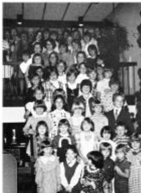
Sunday School 1978