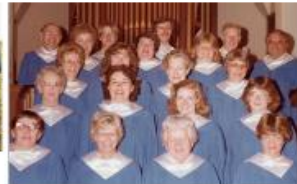
Youth Group Musical 1985