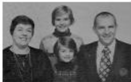
Church Directory 1978