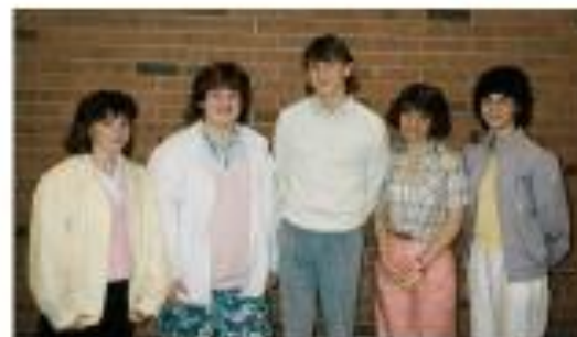
Taylor University Youth Conference 1986