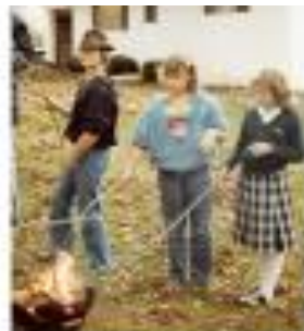
Youth Group Choir 1980s