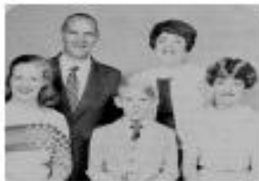
Church Directory 1983